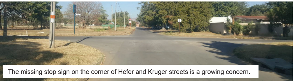
The missing stop sign on the corner of Hefer and Kruger streets is a growing concern.